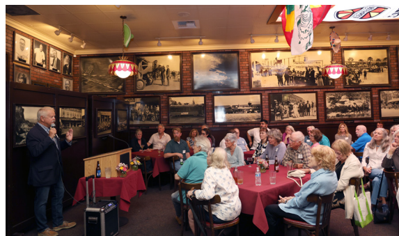
The Mayor's comments were well-received by the appreciative audience at Harry's, a classic Santa Barbara setting.

Want to get involved, or have submissions for The Capital? Email us at PCS@pearlchasesociety.org .